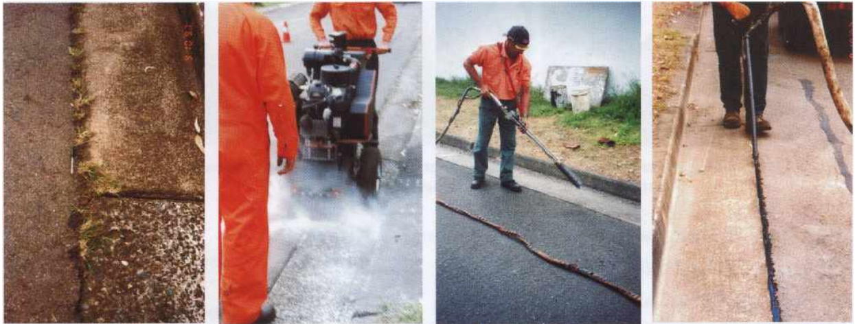
At Blacktown, a recurring grass growth between pavement and curb lip (left) is removed, then the routed crack is thoroughly cleaned then sealed.