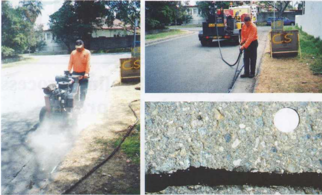
"SAMI's routing process provides a cleaner job that can be filled properly and ensures that the sealant gets down to where it is needed".